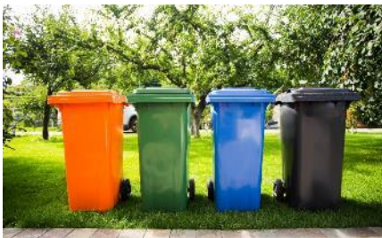
Points of Origin

Waste / Processing residue Renewable non-bio feedstocks