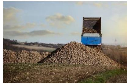
First Gathering Points