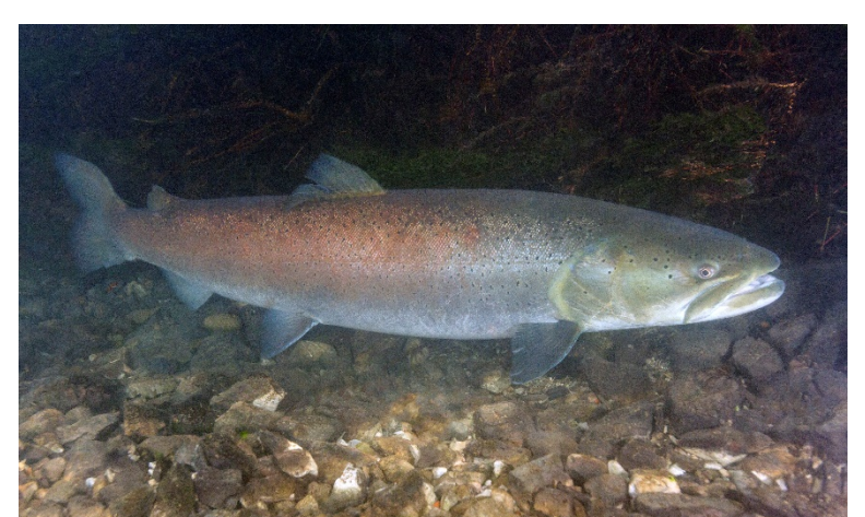
Danube salmon (Hucho hucho) swimming against the current in the Drina river

Furthermore, penstocks, turbines and spillways are a barrier to fish species migrating upstream, or a life threat when moving downstream. The degree of mortality can vary from 0 to 100% at a single hydropower plant, depending on the type of fish present, on the type of hydropower construction and the mitigation measures used. The mortality rate of turbines increases with the velocity and number of rotor blades and decreasing with distance between the blades. Mortality can reach 100% when fish pass through turbines that are mainly in high-pressure plants.<sup>26</sup>