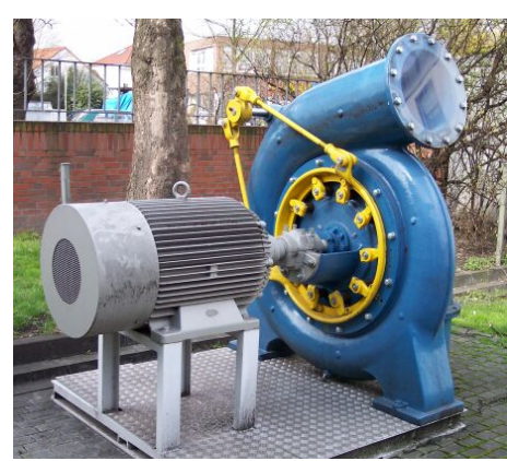
Exterior view of a Francis turbine attached to a generator

For large projects, Directive 2011/92/EU applies a threshold based on the amount of water held back by the dam ("Dams and other installations designed for the holding back or permanent storage of water, where a new or additional amount of water held back or stored exceeds 10 million cubic metres" are referred to in Annex I of the Directive and hence subject to a mandatory environmental impact assessment). As presented in Chapter V of the present Policy Guidelines, when designing feed-in tariffs for hydropower, Contracting Parties generally apply either a threshold based on the capacity of the project (in MW) or the monthly amount of the electricity delivered (in kWh).