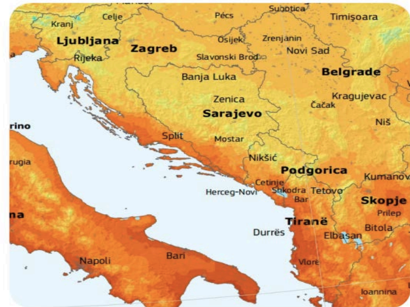
FIGURE 6. Solar resource for South East Europe developed by the European Commission. For further information on solar data—please see http://re.jrc.ec.europa.eu/prg/is/cmapp/eez.htm