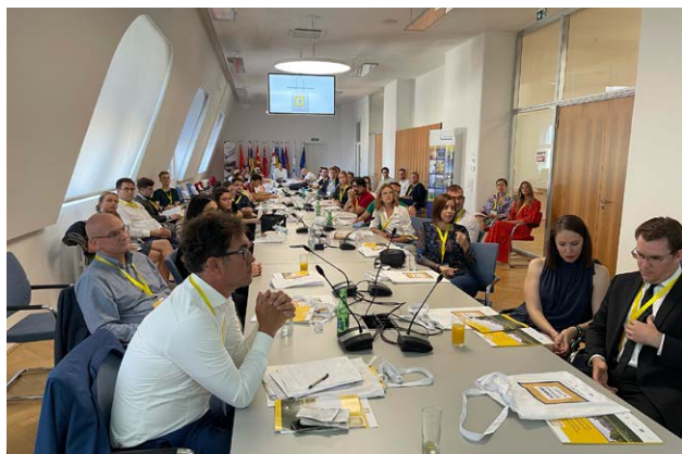
Fifth Energy Community Summer School, 21-28 August 2021, Vienna, Austria

As the first physical event following the Covid-19 lockdown, the fifth edition of the Energy Community Summer School empowered the new generation of energy and climate professionals to engage in the energy sectors in transition. The event was organized by the Energy Community Secretariat in cooperation with the Visegrad Fund and the Friedrich-Ebert-Stiftung, Dialogue Southeast Europe (FES-SOE). Polis University, Tirana; Comenius University Bratislava; Jagiellonian University, Krakow; Masaryk University, Brno; and REKK, Budapest act as project partners since 2016.