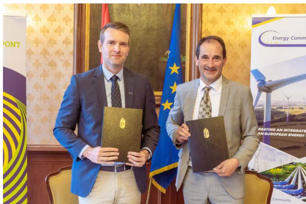
Signing ceremony of the Memorandum of Understanding between the Ministry for Innovation and Technology of Hungary and Energy Community Secretariat, 14 June 2021, Budapest, Hungary

On 14 June 2021, the Ministry for Innovation and Technology of Hungary through its development agency of the Western Balkans Green Center (WBGC) and the Energy Community Secretariat joined efforts to help the Western Balkans fight climate change and foster the region’s green transition. Cooperation will focus on knowledge sharing and exchange programmes.