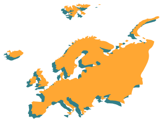
Task Force 6