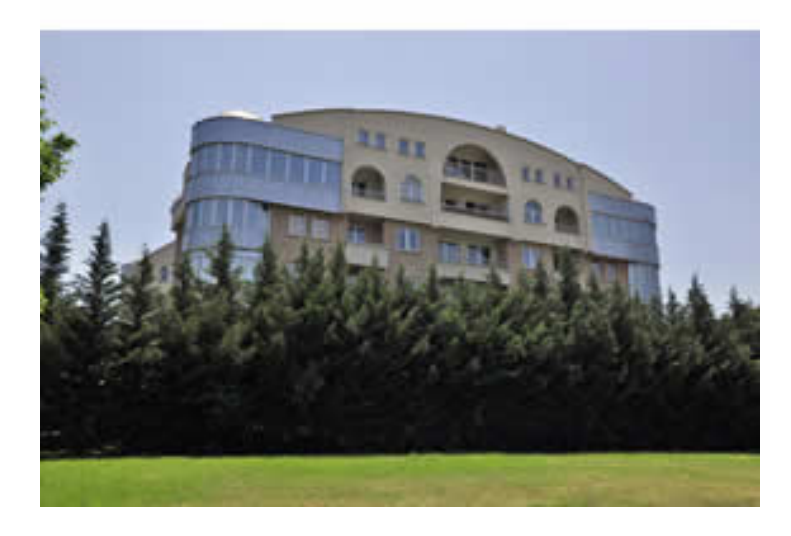
EECG Report on good EEAP implementing practices, June 2016 - FYR Macedonia