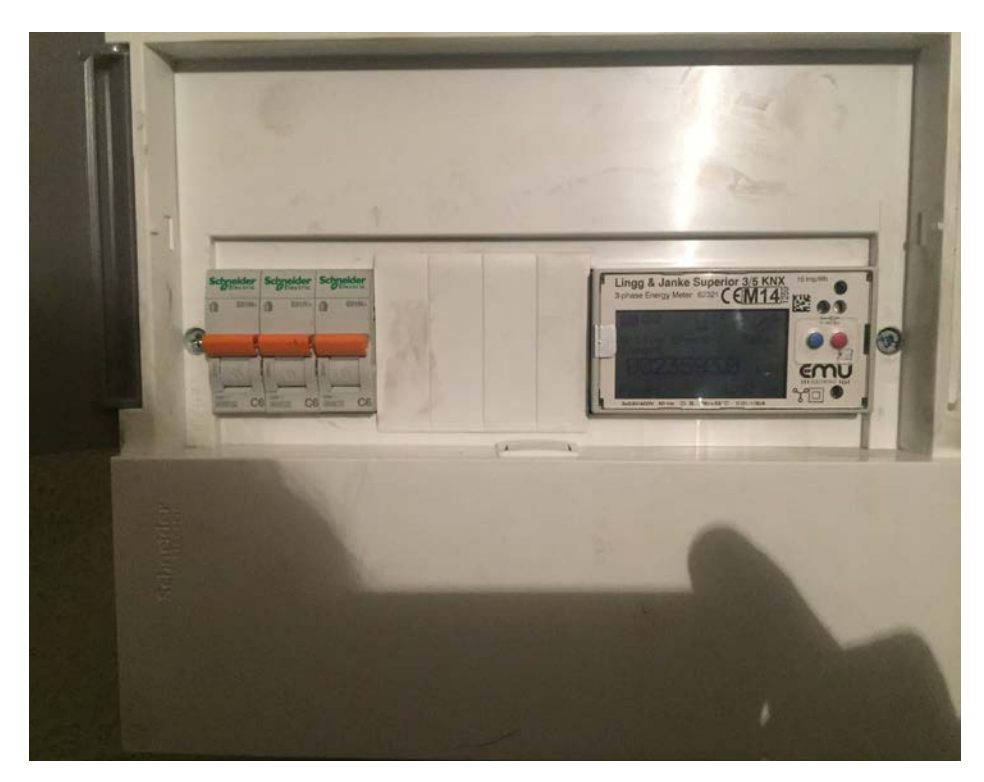
Picture 3. Display for presenting different data acquired from the one of the network analysers